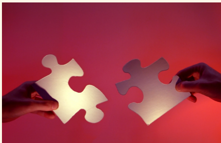
The team shifted their orientation to recognize that everything the youth was doing represented either a strength or a need.

Wraparound facilitator worked hard to get the team to shift their orientation to recognize that everything the youth was doing represented either a strength or a need. This intentional focus on strengths and needs helped to transform the team in just a few months.